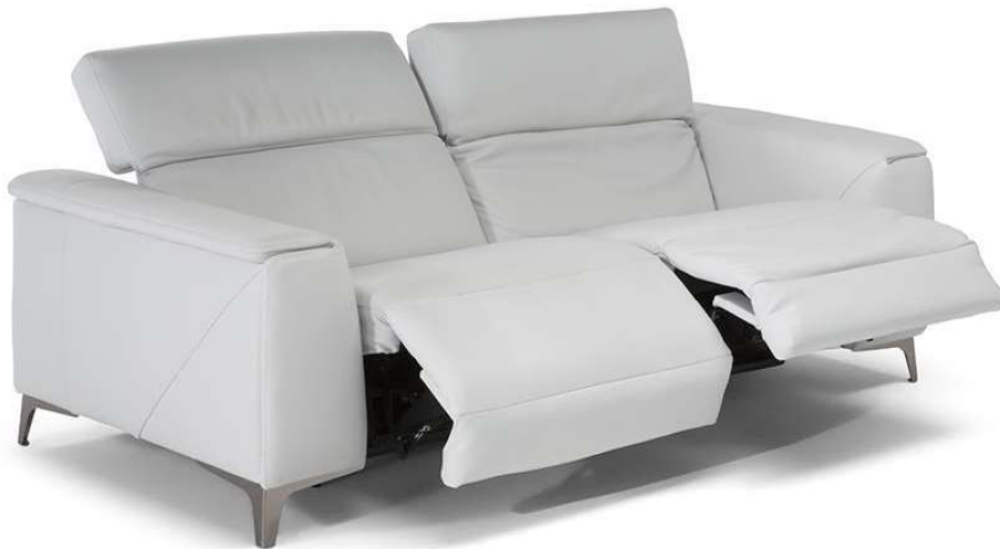
■ Vers. N46