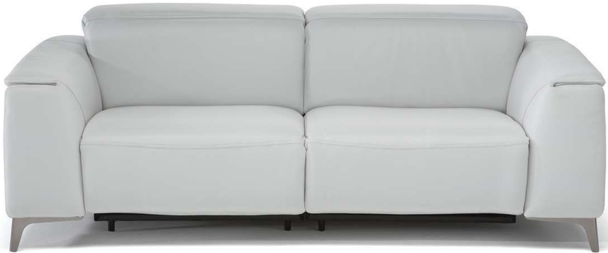
■ Vers. N46