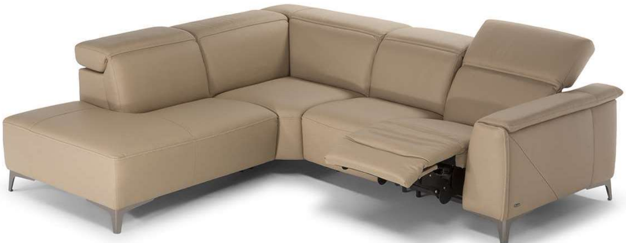
■ Vers. 072+489+001+N02