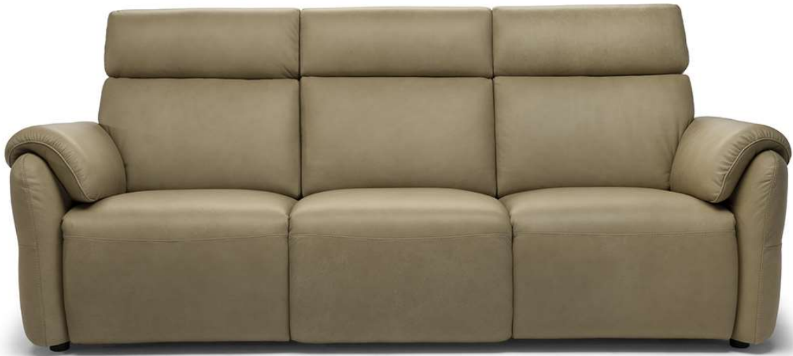
■ Vers. 155