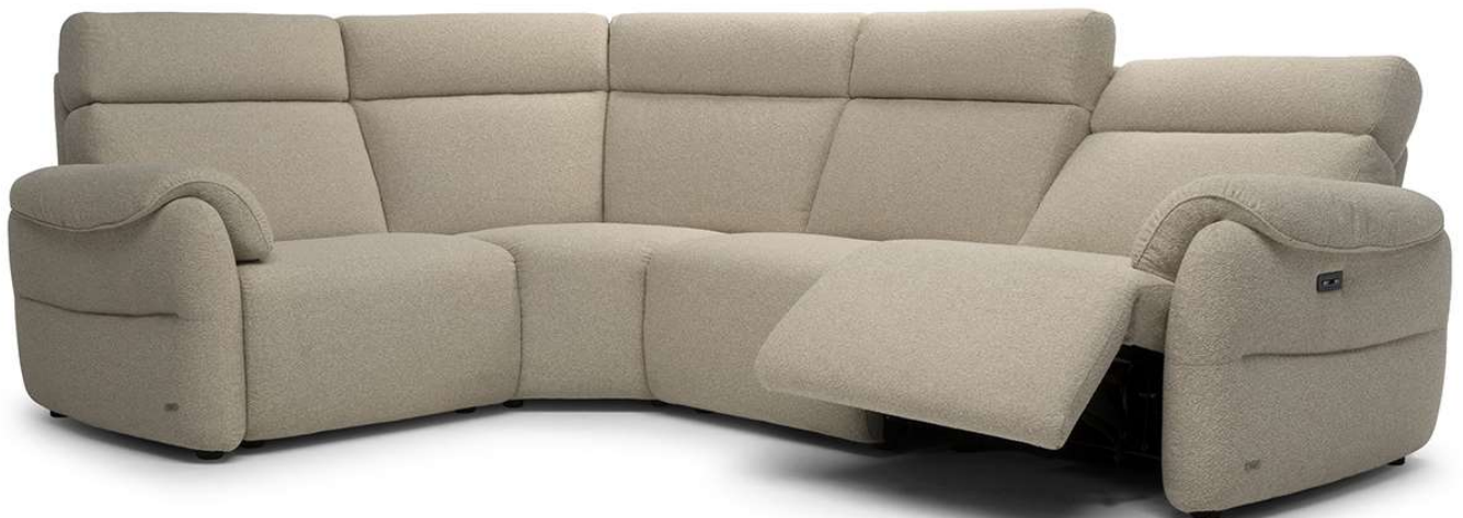
■ Vers. 272+076+291+F52