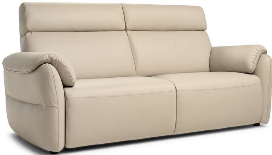
■ Vers. 009